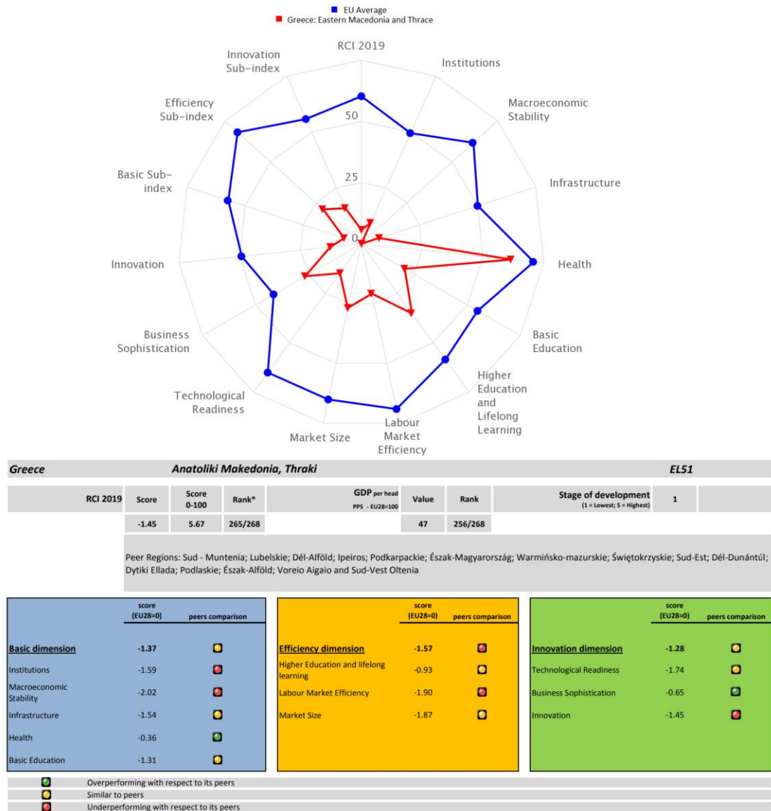
Figure 1: The REMTh according to the Regional Competitiveness Index (RCI), based on Annoni and Dijkstra (2019)

The Regional Competitiveness Index (RCI) methodology is based on the Global Competitiveness Index of the World Economic Forum, except that it measures the different dimensions of competitiveness at EU level regions. According to the authors (Annoni and Dijkstra, 2019, p. 3), “Regional competitiveness is the ability of a region to offer an attractive and sustainable environment for firms and residents to live and work.” RCI consists of 11 pillars divided into three groups: Basic, efficiency, and innovation. The “basic” group comprises five pillars representing the substrate of the economy (institutions, macroeconomic stability, infrastructure, health, and basic education). As these pillars develop in one area, the next step is attracting a more specialized workforce that, in turn, leads to a more efficient labor market. Thus, the “efficiency” group comprises higher education and lifelong learning, labor market efficiency, and market size. Finally, at the most advanced stage of the regional economy, three pillars determine regional innovation, that is, technological readiness, business sophistication, and innovation. The RCI also compares regions that are at a similar level of development (other “peers”), as it identifies the 15 regions closest to one under analysis in terms of average 2015-2017 GDP per capita.